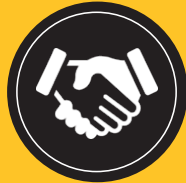
HSE Leadership Partnering to Zero