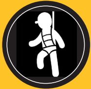
High Risk Activity Documents