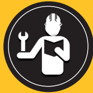
HSE Operating Procedures