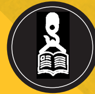
Hazard ID & Control Knowledge Articles