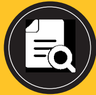
Project HSE Plan